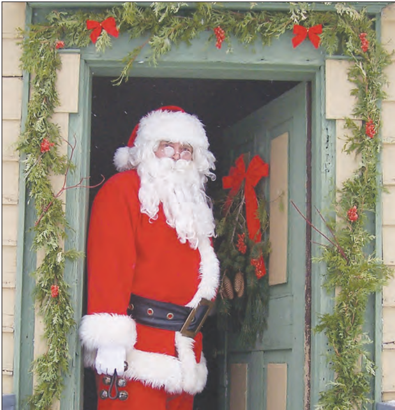
Santa Claus will be at the door waiting for kids on Dec. 7 when he makes a special appearance at the Scugog Shores Museum's annual children's Christmas event.

It's a magical time of year at the Scugog Shores Museum as staff are busy making preparations for the annual 'Children's Old-Fashioned Christmas'.