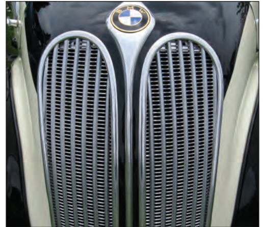
Clockwise from above left, Dog Days of Scugog, the Car Show and Flea Market, Canoe The Nonquon and Pioneer Fall Fair.